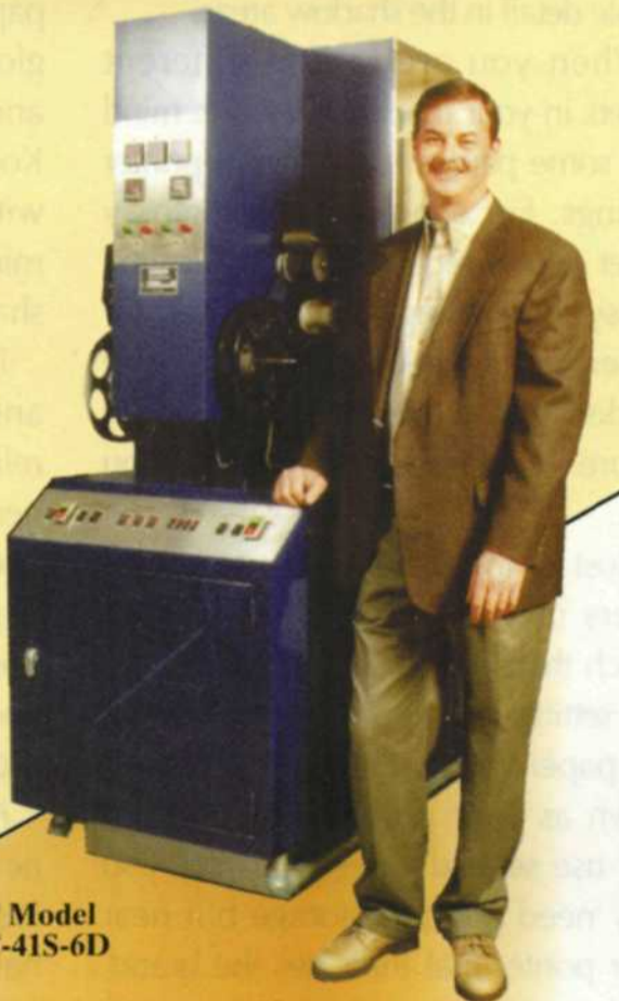
"S" Model KPC-41S-6D